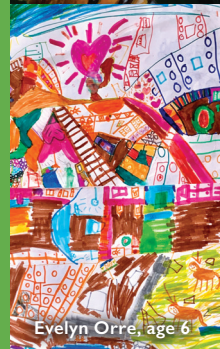
Evelyn Orre, age 6