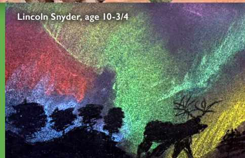
Lincoln Snyder, age 10-3/4