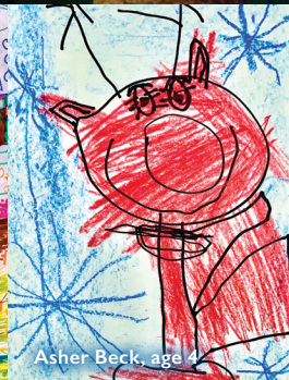
Asher Beck, age 9