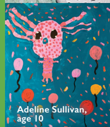
Adeline Sullivan, age 10