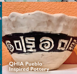
QHIA Pueblo Inspired Pottery