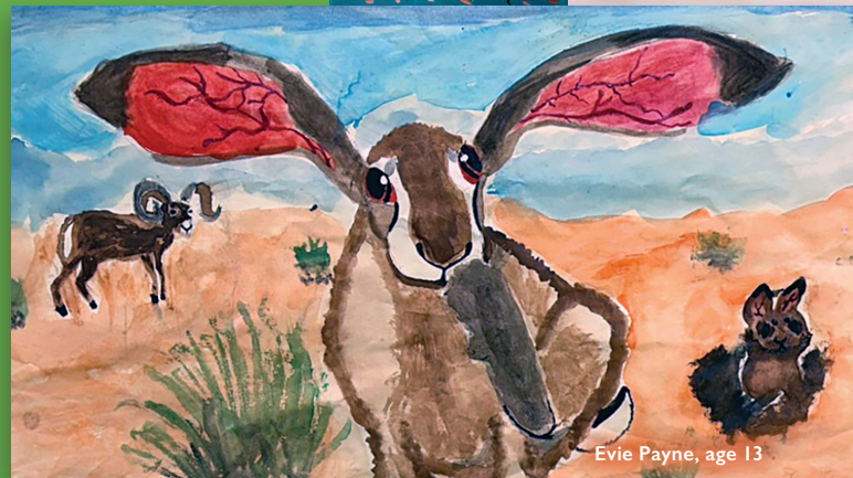
Evie Payne, age 13