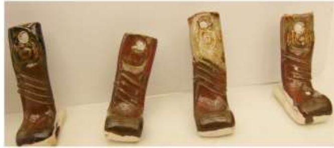
1ST DIP: OHATA (K)