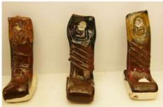
1ST DIP: OHATA (K)