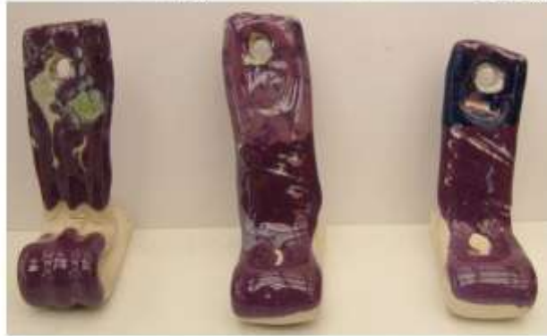
1ST DIP: PURPLE HAZE (G)