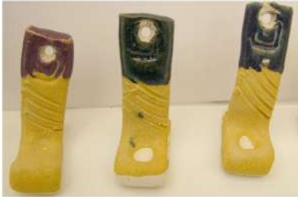
1ST DIP: WOO YELLOW (C)