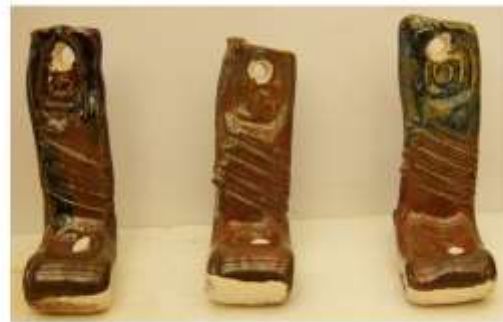
1ST DIP: OHATA (K)