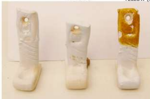
1ST DIP: WHITE LINER (B)

2ND DIP: CLEAR (1) WHITE LINER (2) WOO YELLOW (3)