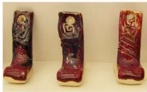
1ST DIP: CANDY RED (L)