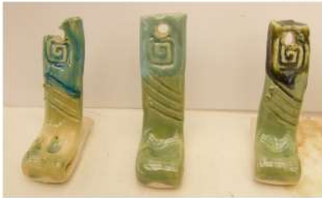
1ST DIP: OPALESCENT GREEN (E)

2ND DIP: CLEAR (1) WHITE LINER (2) WOO YELLOW (3)