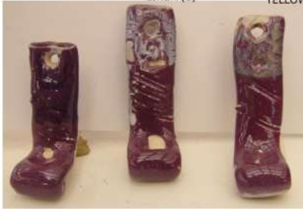
1ST DIP: PURPLE HAZE (G)