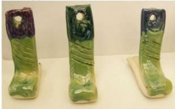
1ST DIP: OPALESCENT GREEN (E)

2ND DIP: PURPLE HAZE (7) BLACK SKY (8) BLACK GOLD (9)