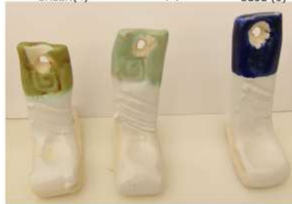
1ST DIP: WHITE LINER (B)

2ND DIP: SEAFOAM GREEN (4) OPALESCENT GREEN (5) NOXIMA BLUE (6)