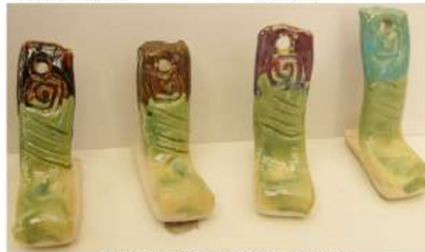
1ST DIP: OPALESCENT GREEN (E)

2ND DIP: TEADUST TENMOKU (10) OHATA (11) CANDY RED (12) TURQ-RED (13)