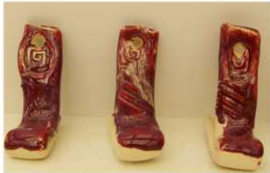
1ST DIP: CANDY RED (L)