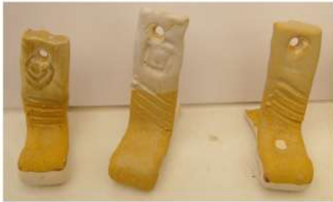
1ST DIP: WOO YELLOW (C)