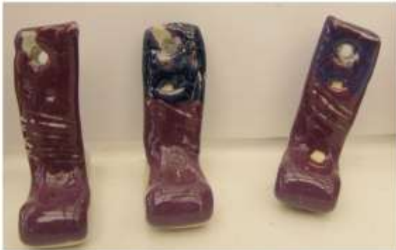
1ST DIP: PURPLE HAZE (G)