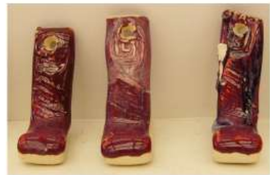
1ST DIP: CANDY RED (L)