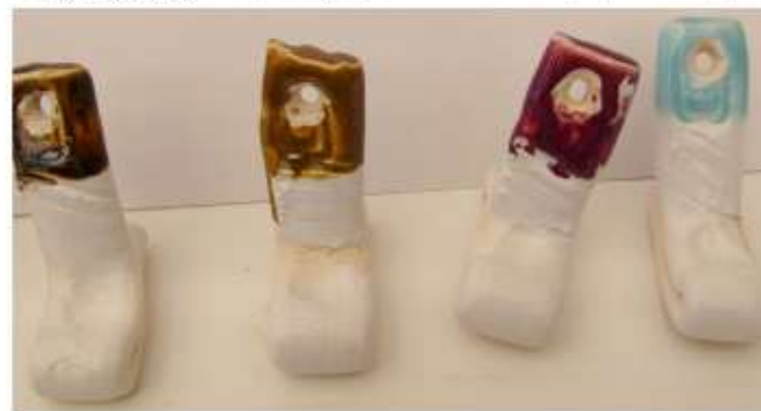
1ST DIP: WHITE LINER (B)

2ND DIP: TEADUST TENMOKU (10) OHATA (11) CANDY RED (12) TURQ-RED (13)