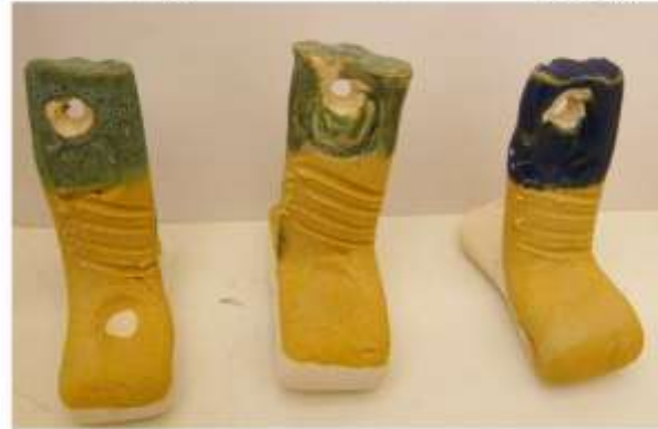
1ST DIP: WOO YELLOW (C)