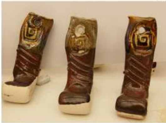
1ST DIP: OHATA (K)