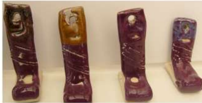
1ST DIP: PURPLE HAZE (G)