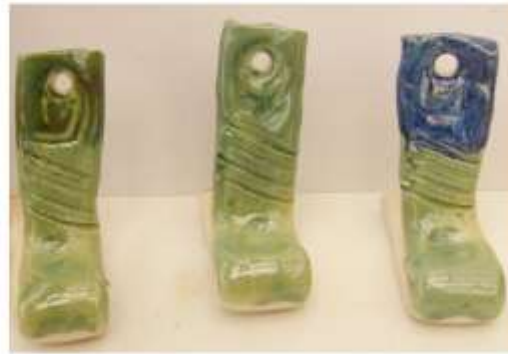
1ST DIP: OPALESCENT GREEN (E)

2ND DIP: SEAFOAM GREEN(4) OPALESCENT GREEN (5) NOXIMA BLUE (6)