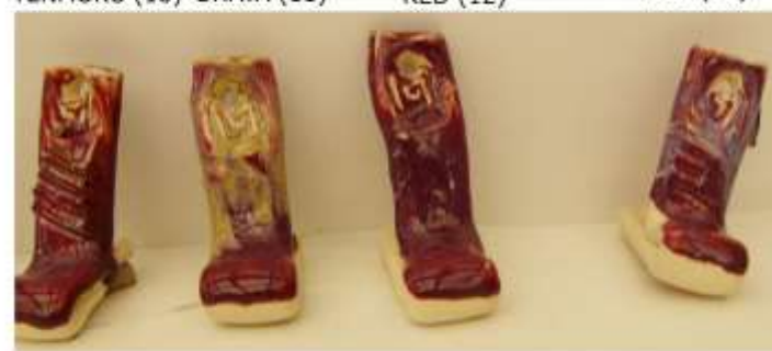
1ST DIP: CANDY RED (L)