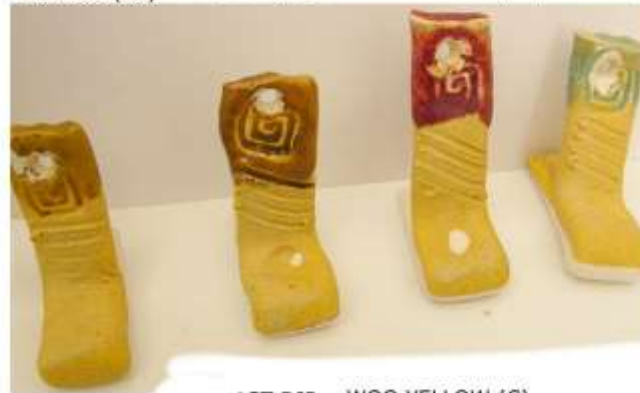
1ST DIP: WOO YELLOW (C)